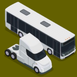
Trucks and buses leasing